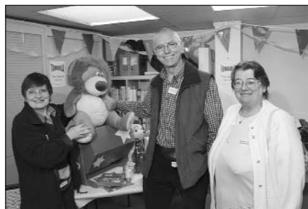
Volunteers at Spring Fair

The final event in our calendar, the Home's annual Christmas Fair, ended the year on a high. We were back over at the Dogs Home after the completion of the new small animal unit, so it was a bit of a squeeze. It was a bright, if cold day and despite a few blue lips, the day was a massive success. The crowds turned out in record numbers which really boosted everyone's spirits and a great day out was had by all. We really went out with a bang as the event raised over £3,500 profit (nearly £1000 more than 2009!), more than ever before!