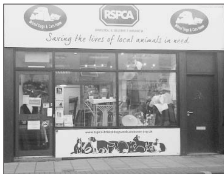
New fascia on the Charity Shop

The dog show in June was fantastic this year and I feel sure we will be back in Whitehall again this year all being well. The Fundraising team did a tremendous job organising this event and the delicate decision to move the event to a new site paid off, so well done to all concerned.