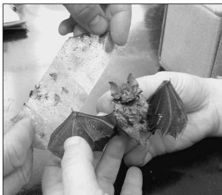
Bat stuck on fly paper

We took in 838 wildlife casualties, one of which was a little bat who had got himself into a bit of a predicament. He had flown into a sticky fly strip and, along with lots of unfortunate flies, found himself firmly attached to it. He was rescued by a member of public, who carefully peeled him off the paper, then brought him into the Clinic for assessment. Luckily there were no physical injuries, but there was still glue on his wings,