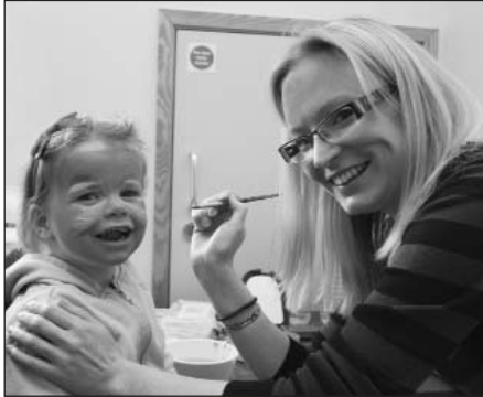
Volunteer face painting

we were able to keep costs down thanks to the generosity of all organisations who donated prizes, especially Paul Roberts Hi-Fi and Ramada Plaza Hotel for our top prizes. As a result we actually raised over £200 more than last year.