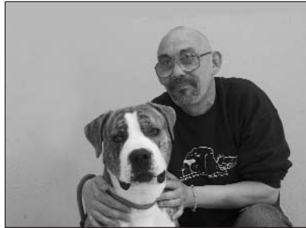
Plug with Gizmo