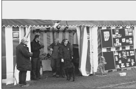
RSPCA Staff at Badminton