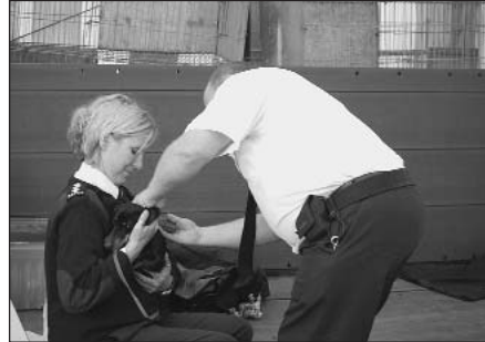
Microchipping a dog at Badminton

We attended Badminton again this year, and decided to be more pro-active in our attempts to fund raise. So as well as monitoring dogs in hot cars and stray/sick dogs, we had a few fund raising ideas within our tent and also decided to micro chip dogs in return for a donation. This proved far more popular than anticipated and attracted visitors to the event as well as organisers and the local farmer! I used 99 of the 100 chips I ordered and managed to raise about £600, which again went into the regional fund. Our push on microchipping proved its point when we picked up a stray that was chipped and shown as belonging to someone in Lithuania! Fortunately, before we made a decision whether to incur an