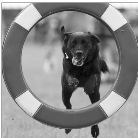
Dog having a go at Dog Show

and Fun Day but this year we had a change of location. Due to the limitations imposed at Ashton Court we felt that there was little room for developing the event. After a long hunt for a suitable venue we finally relocated to Whitehall Rugby Football Club in Speedwell, not too far from the Centre. This venue provided us with the opportunity to increase our income and decrease our expenditure which is exactly what we achieved. Despite its lesser known location, thousands of people turned out to enjoy the warm summer day with their family and four legged (sometimes three!) friends. The event raised £5,049.36 profit, nearly £2,000 more than in 2009! Well done to everyone involved and lets hope we can make it an even bigger hit in 2011.